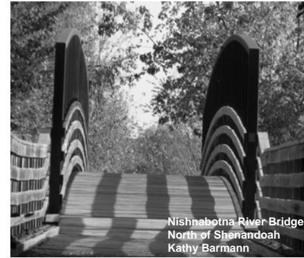
Nishnabotna River Bridge North of Shenandoah

ultimately connect these two trail networks. The challenges are great, and we are just at the starting gate with our trail plans. Most of our communities in Northwest Missouri have not had any experience with trails. Thus, we have a big challenge to get folks to appreciate the value and the importance trails can bring to their communities quality of life and economic vitality. Our shared futures both in Southwest Iowa and in Northwest Missouri could be vastly enriched if we can find common ground to someday interconnect our trail systems.